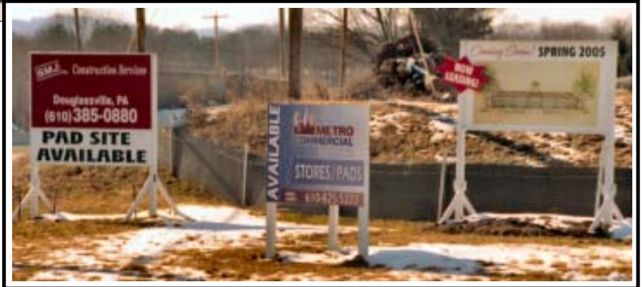
SMJ Drawing and Photo

An open, inviting plaza design of handsome brick and masonry, top, entices shoppers to stop and browse the Shoppes At Amity. Signs announcing leasing activity are attracting tenants to the site.